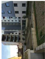
Existing rear landscape