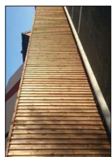
ERECTION OF ACOUSTIC FENCE

AUTOMATIC OPENING METAL GATES TO MATCH EXISTING ENTRANCE GATES TO MAINTAIN VISUAL APPEARANCE AND REDUCE AIR POLLUTION AND NOISE.